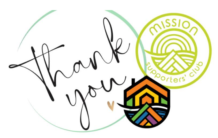
Mosgiel Women's Fellowship.

You may be few but you are mighty with your support to our Ōtepoti Youth Transition House.